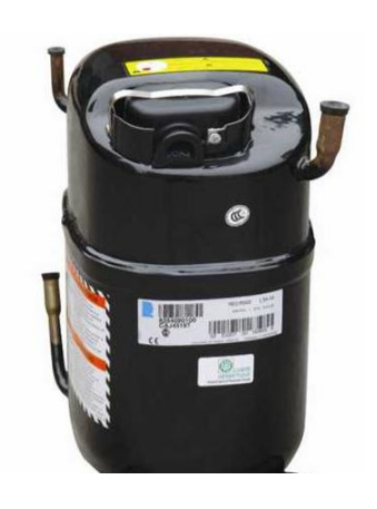
France Tecumseh compressor